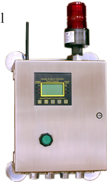
Available in NEMA 4X non-metallic, painted or stainless steel and NEMA 7 explosion proof wall mount

A large graphic LCD screen displays input data as calibrated engineering units, bar-graphs or 30-minute trends. Three adjustable alarm levels per channel, combined with programmable relays with voting logic allows flexible control of beacons, horns and other warning devices. Highly visible red and yellow LEDs visually indicate alarm status at all times. An internal real-time clock and event log maintain a record of calibration and alarm events.